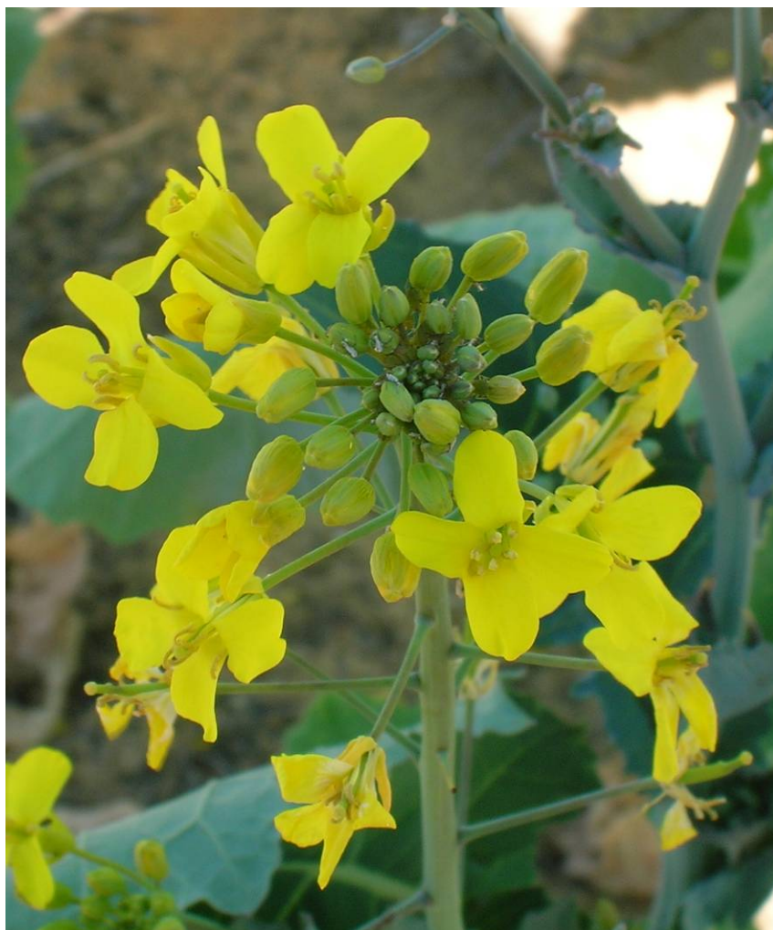
Figure 3. Flowering raceme of canola ( B. napus ).

and/or be insect pollinated (OECD 1997) and whose pollen can also become airborne and potentially travel at least several kilometres downwind (Treu & Emberlin 2000).